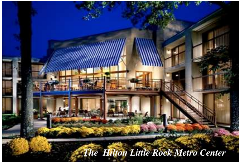
The Hilton Little Rock Metro Center

The registration fee does not include lodging. The Hilton Little Rock Metro Center , Little Rock, Ark. is offering guest rooms at a special rate of $82.00 per night . This room rate applies for Wednesday, October 29 through Saturday, November 1. Conference participants must make their own room reservations at the Hilton by calling (501) 664-5020 . Guests must request the Arkansas Watershed and Stream Teams Conference room block to reserve a room at this special rate. The deadline to make reservations at this rate expires on October 3, 2008; afterwards, the room rates will be at regular price.