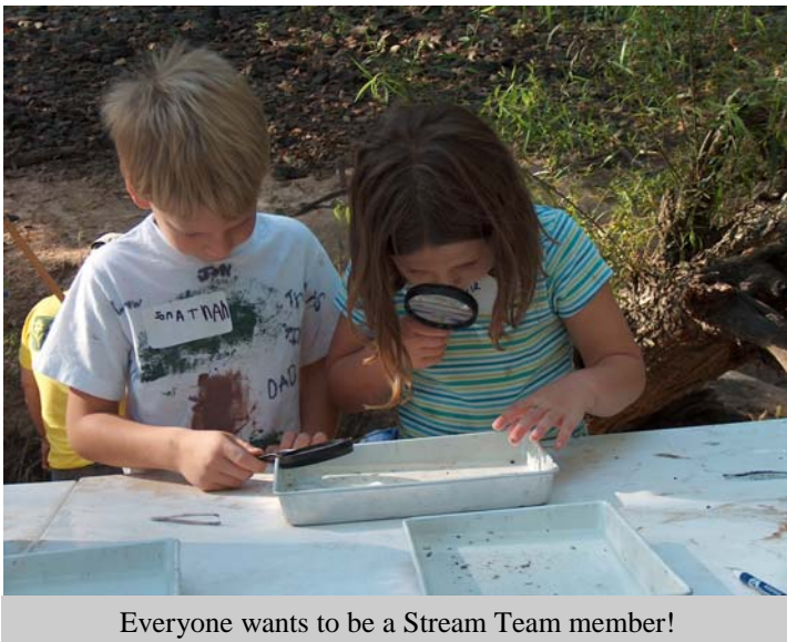
Everyone wants to be a Stream Team member!

Fill out and mail in your registration form today!